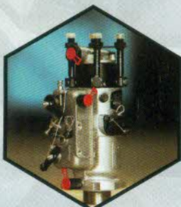
Fuel Efficient Original Delphy Brazilian Pump and Injector