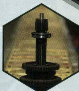
SAE 8620 Gearing & Shafting