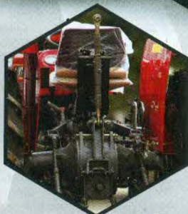
Heavy Duty Top Link