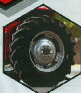
Heavy Duty General Brand Tyre and Rims