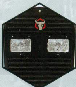
High Lux Crystal Head Lamps