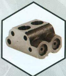
Forged Heavy Duty Hydraulic Chamber Body